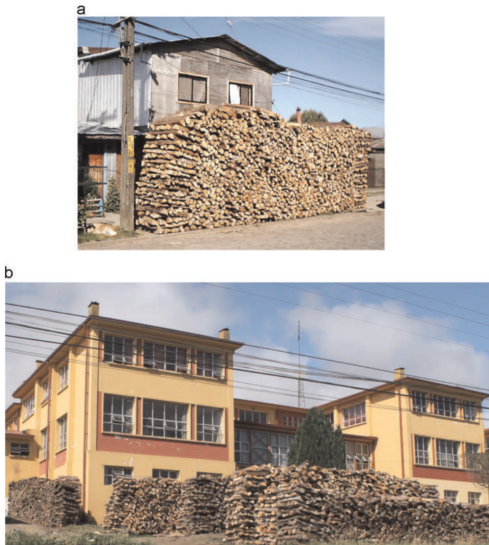
Fig. 2. Firewood purchased in summer piled outdoors in cities of the XIV Region of Chile: (a) for a house, (b) for a school building.

firewood sold under government regulation with a maximum of 25% moisture (CONAMA, 2008).